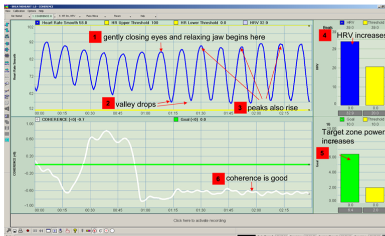
Figure 2: Bridges Facilitate Immediate Changes In Heart Rate (Instrument: COHERENCE BreatheHeart)

If we think about it, it makes sense that body input and output functions would have the ability and necessity to open and close to the environment, “letting in” and “letting out” as required. While the ears, the breasts, and the skin can be argued to possess both unconscious and conscious nervous control, they don’t possess the ability to open and close as do other bridges. As compared to the eyes, we are unable to deny senses of hearing and of touch, probably relegating them to some more fundamental role in our evolutionary past.